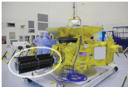
The New Horizons spacecraft, with its radioisotope power system attached (circled), is prepared for its January 2006 launch to explore Pluto and the Kuiper Belt, starting in 2015.

Regardless of the power source, mission success is the driving force behind all of NASA's engineering decisions. At every stage, this drive for success is grounded in planning for the safety of the general public and project personnel, which guides NASA's use of RPS from start to finish.